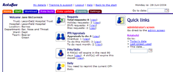
Friendly, helpful screens...